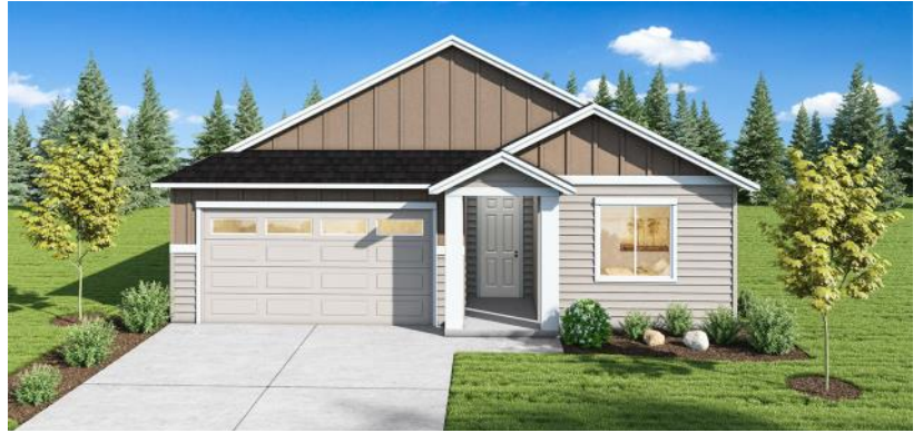
Elevation I 2 Car Garage

Exterior Stone, Front and Garage door style may vary depending on neighborhood standards and selections.