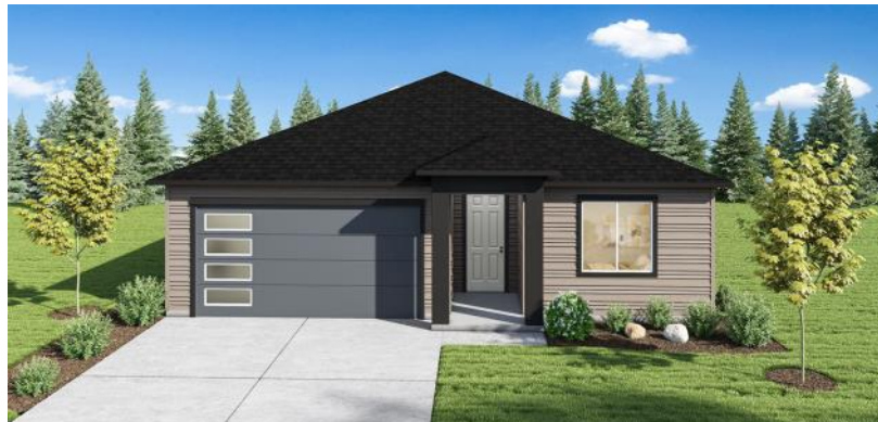
Elevation II 2 Car Garage

Exterior Stone, Front and Garage door style may vary depending on neighborhood standards and selections.