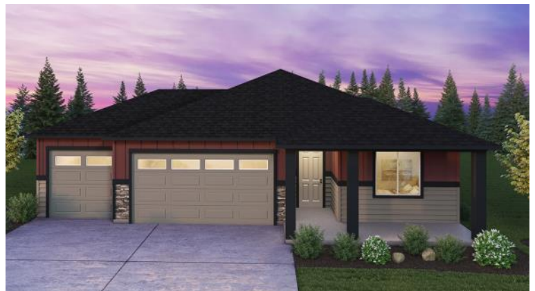
Elevation III 3 Car Garage

Exterior Stone, Front and Garage door style may vary depending on neighborhood standards and selections.