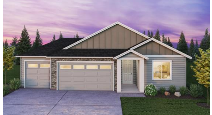
Elevation I 3 Car Garage

Exterior Stone, Front and Garage door style may vary depending on neighborhood standards and selections.