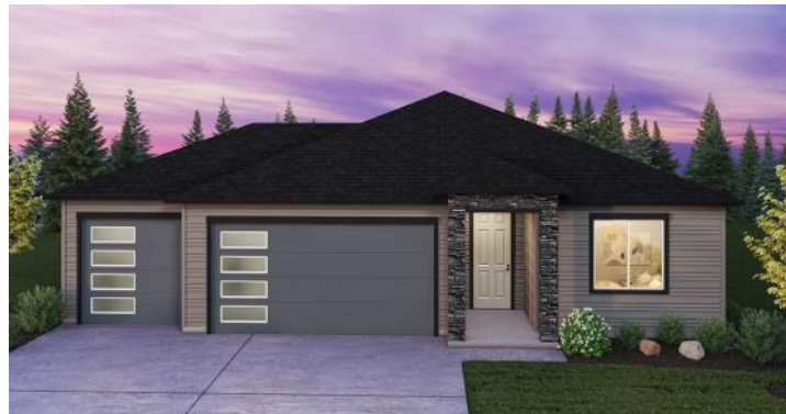
Elevation II 3 Car Garage

Exterior Stone, Front and Garage door style may vary depending on neighborhood standards and selections.