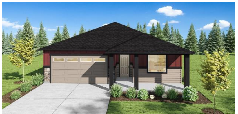
Elevation III 2 Car Garage

Exterior Stone, Front and Garage door style may vary depending on neighborhood standards and selections.